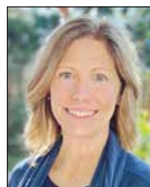
Elizabeth Hills Foundation Board President